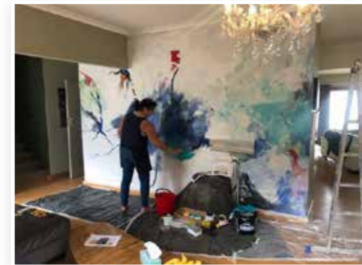
Raag Strydom at work.